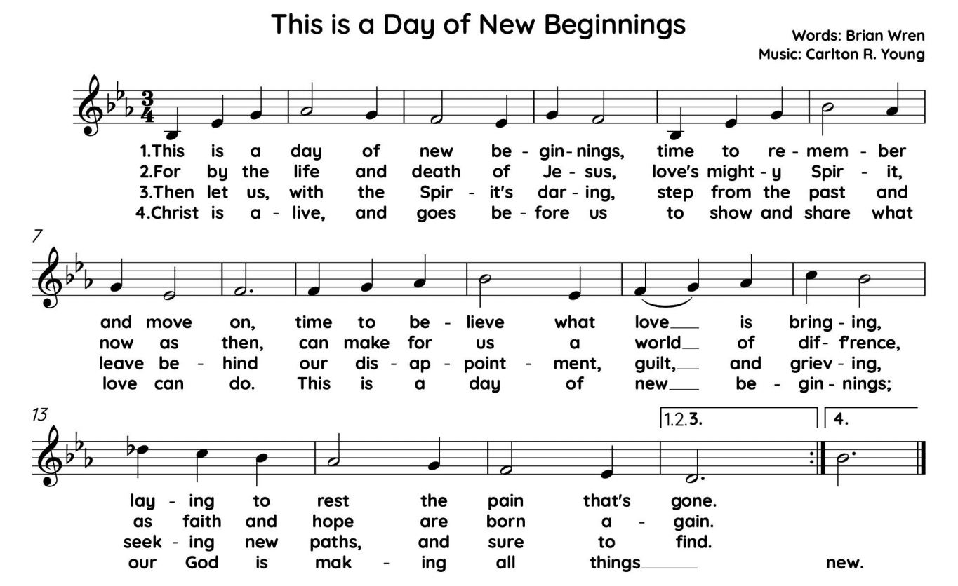
Words © 1983, 1987 Hope Publishing Company Music © 1987 Hope Publishing